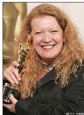
Andrea Arnold, guest at KFF8